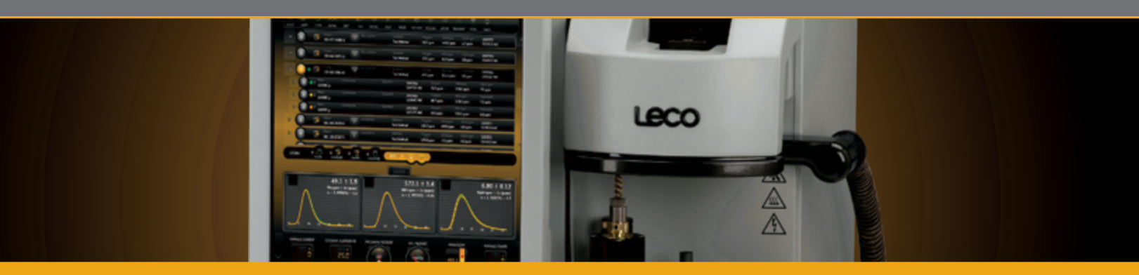
ONH836 Series: Oxygen/Nitrogen/Hydrogen by Fusion